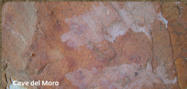
Cave del Moro