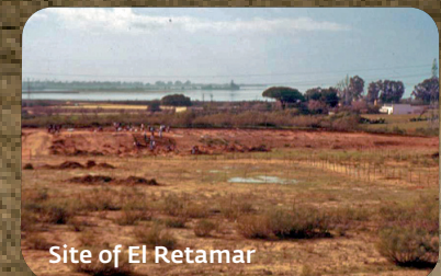
Site of El Retamar